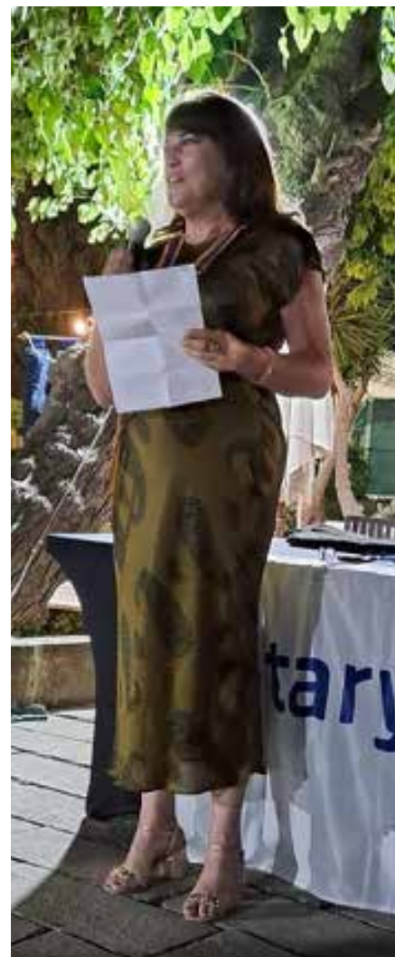
Riano is splendid with the opening of someone who promises well, indeed very well!