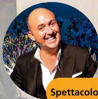
Spettacolo di Cabaret

Evento di raccolta fondi pro Rotary Foundation