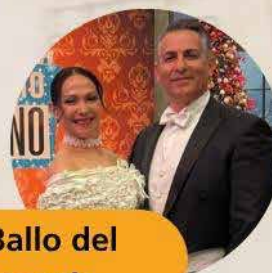
Gran Ballo del Gattopardo

III Cortile Palazzo Filangeri di Cutò Santa Margherita di Belice (AG) Sabato 9 agosto, ore 20.30